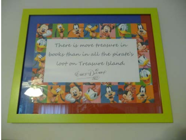
9 My picture with the quote from Walt Disney