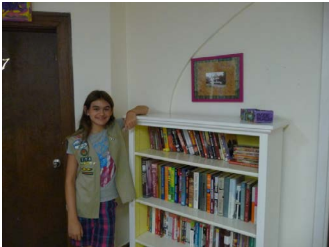
4 It takes a lot of time to fill up and organize one of these bookcases!