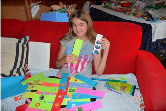
1 Me making bookmarks for the library