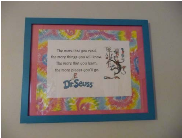
7 My picture with the quote from Dr. Seuss