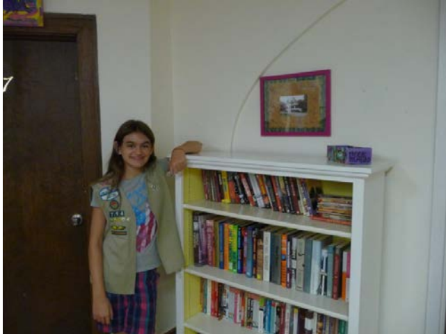
6 Me with one of the finished bookcases