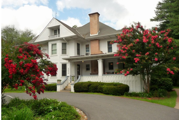
The Stepping Stones Shelter