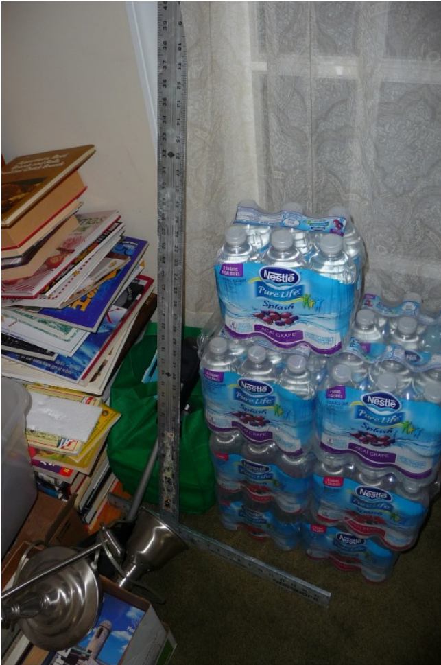
2 Books being gathered for the Stepping Stones Library