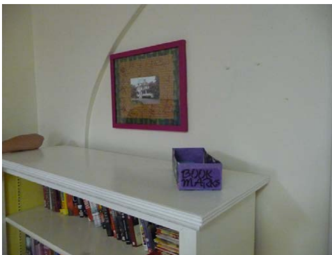
5 Bookmark holder and picture of shelter