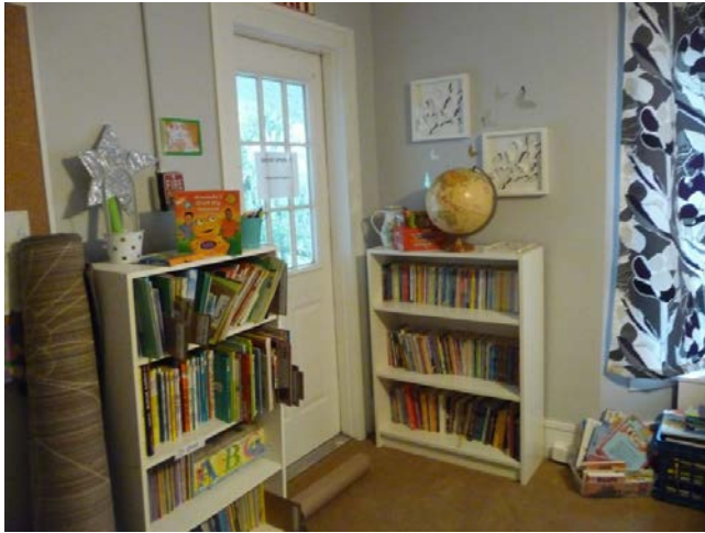
10 The library at the Stepping Stones Shelter