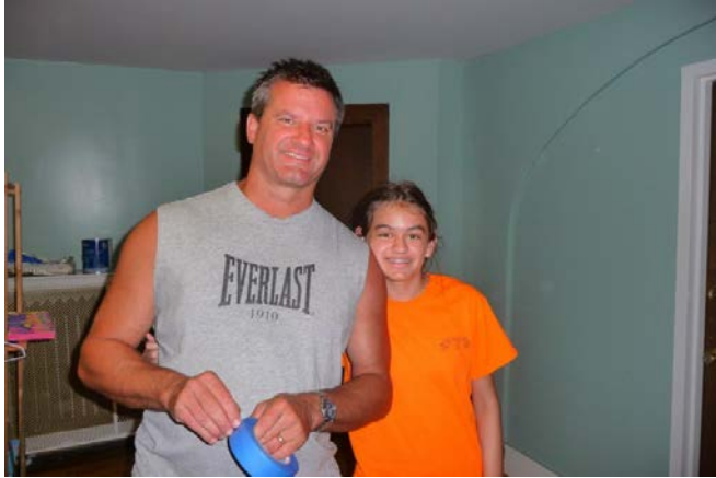
3 Me and my dad painting at the Stepping Stones Shelter